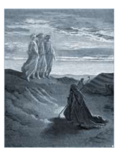
(Artist: Gustave Dore Date: 1852)